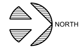
1 FIRE ACCESS PLAN 1" = 40'-0"